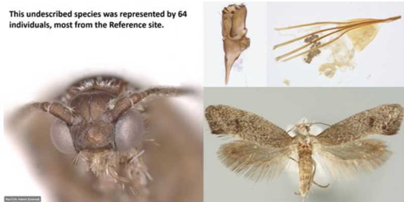
Image: sk'w'itkax'ni (shkwoon-kwleet-kaxh-nee / brown copper moth)

For more information, visit the CNA and K'en T'em's social media channels, contact the Communications Department at communications@cna-trust.ca , or call 250-378-1864.